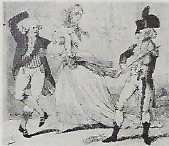
FUTURE GEORGE IV AND WIFE

● LIFE passed over George IV's marriage since it was not officially recognized, but should have taken note of Edward VIII who was and is a member of the royal family, though he had abdicated at the time of his marriage. Margaret is the first royal princess to marry a commoner since Cecilia, daughter of Edward IV, married Thomas Kymbe 450 years ago.—ED.