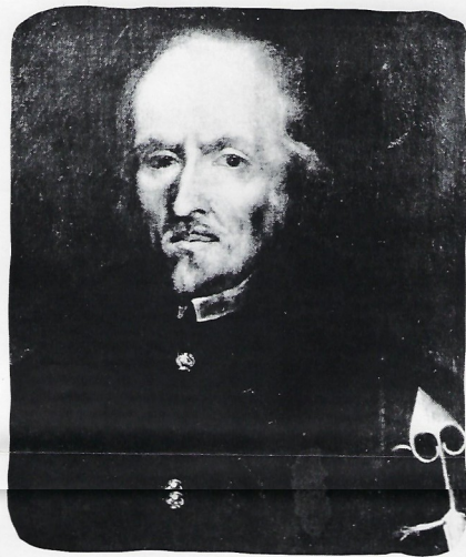
Each morning and afternoon session will be held in the Theatre of the Folger Shakespeare Library (201 East Capitol Street, S.E.) and will include three thirty-minute presentations, one thirty-minute break, and one one-hour discussion period.